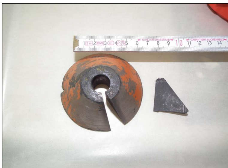
Fig. 2 – The objects seized in illicit trafficking.

In August 2010, the Laboratory of Radiation Control (LRC) located in the Republic of Moldova received 1.8 kg of metal containing uranium which was seized in illicit trafficking. There were two items received, which were weighed and had their dimensions measured. The larger object (object 1) was frustoconical with a missing part. The inner and outer diameters were 34 mm and 85 mm, and the height 35 mm. The total weight of the object was 1760 g. The smaller object (object 2) was identified as the missing part of the object 1. Its mass was measured as 96.68 g (Fig. 2).